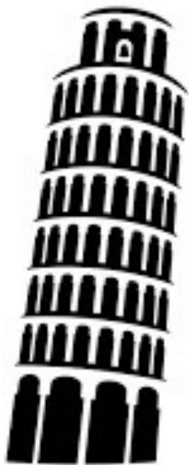
Table Talks GOES INTERNATIONAL!

the third Friday of the month at noon August-November 2023